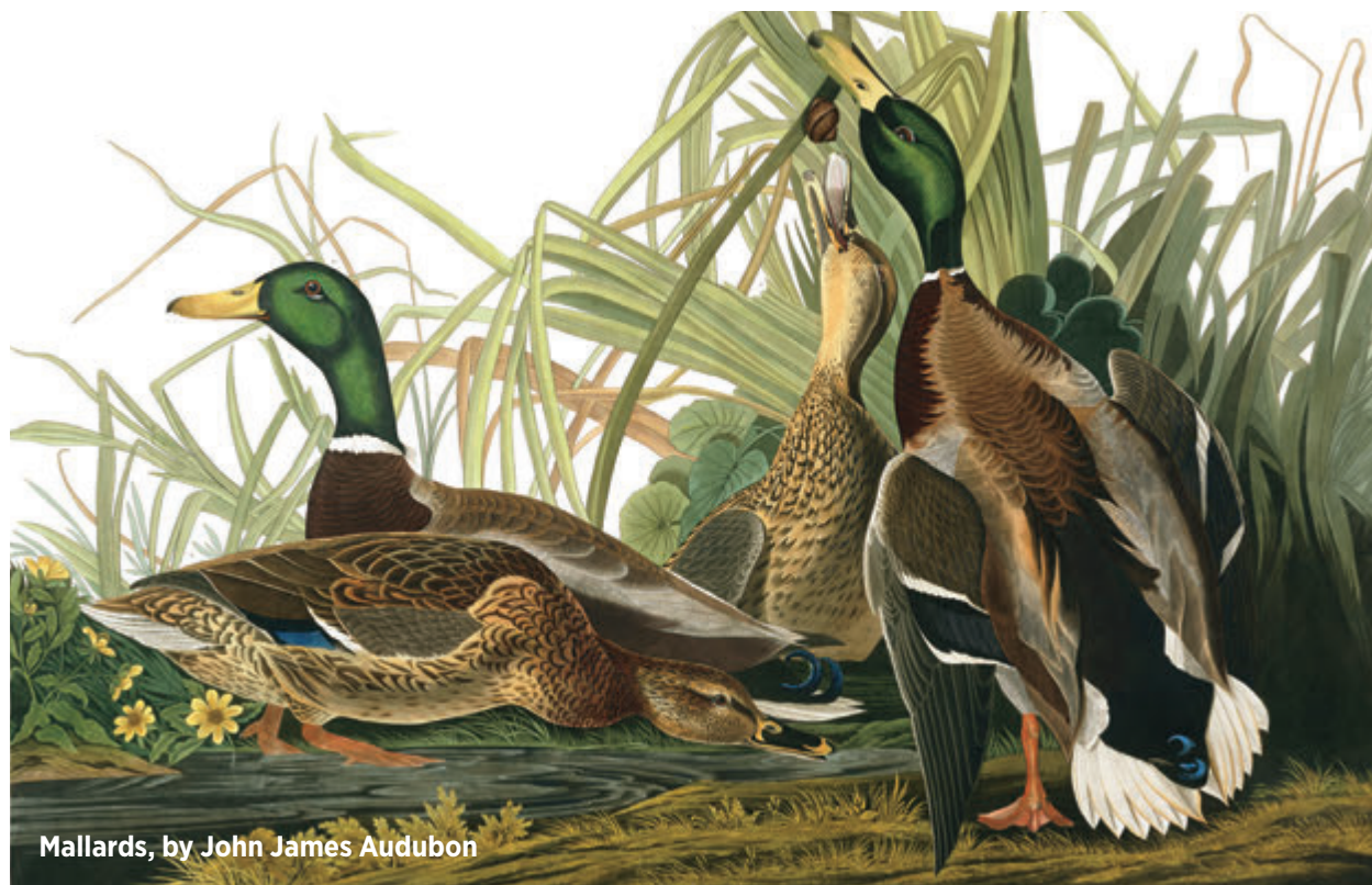
Mallards, by John James Audubon

These works of art were created by students 14, 15, and 11 years old. Inspired by John James Audubon, they made portraits of birds they found in their communities. They learned about the birds' habitats, behaviors, and field marks. Everyone can show their love of nature through art. Try it!